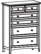
1180AUF 6-Drawer McKenzie Chest