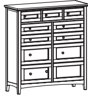
1181AUF 11-Drawer McKenzie Chest